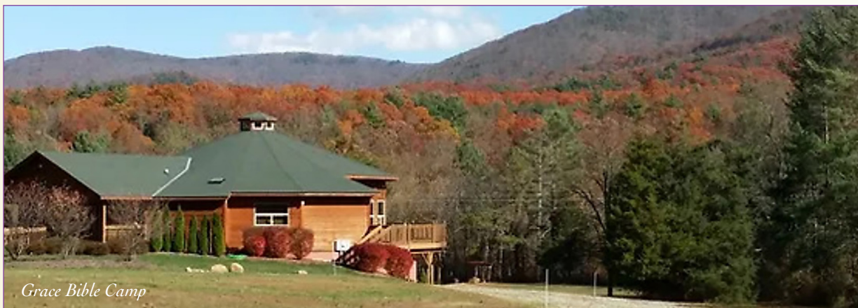
Grace Bible Camp